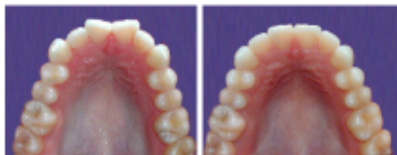
Rotated, crowded anterior teeth.

At first glance you may think you need braces, however with the patented Inman Aligner, your front teeth can be gently guided to an ideal position quickly and effectively, in a matter of weeks.